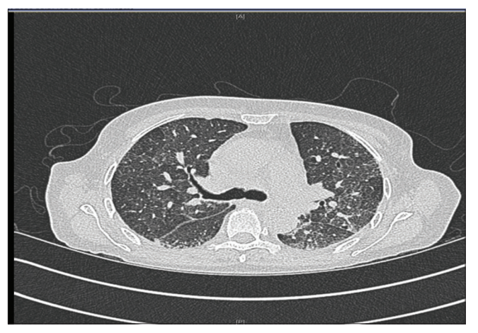
Figure 1: High resolution CT chest, axial view