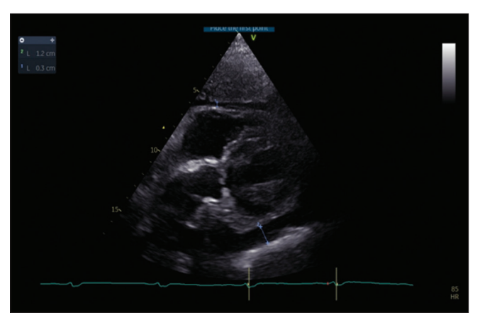
Figure 3: Transthoracic echocardiography, subcostal view

Gastrointestinal involvement, in particularly abnormal esophageal motility, is present in almost